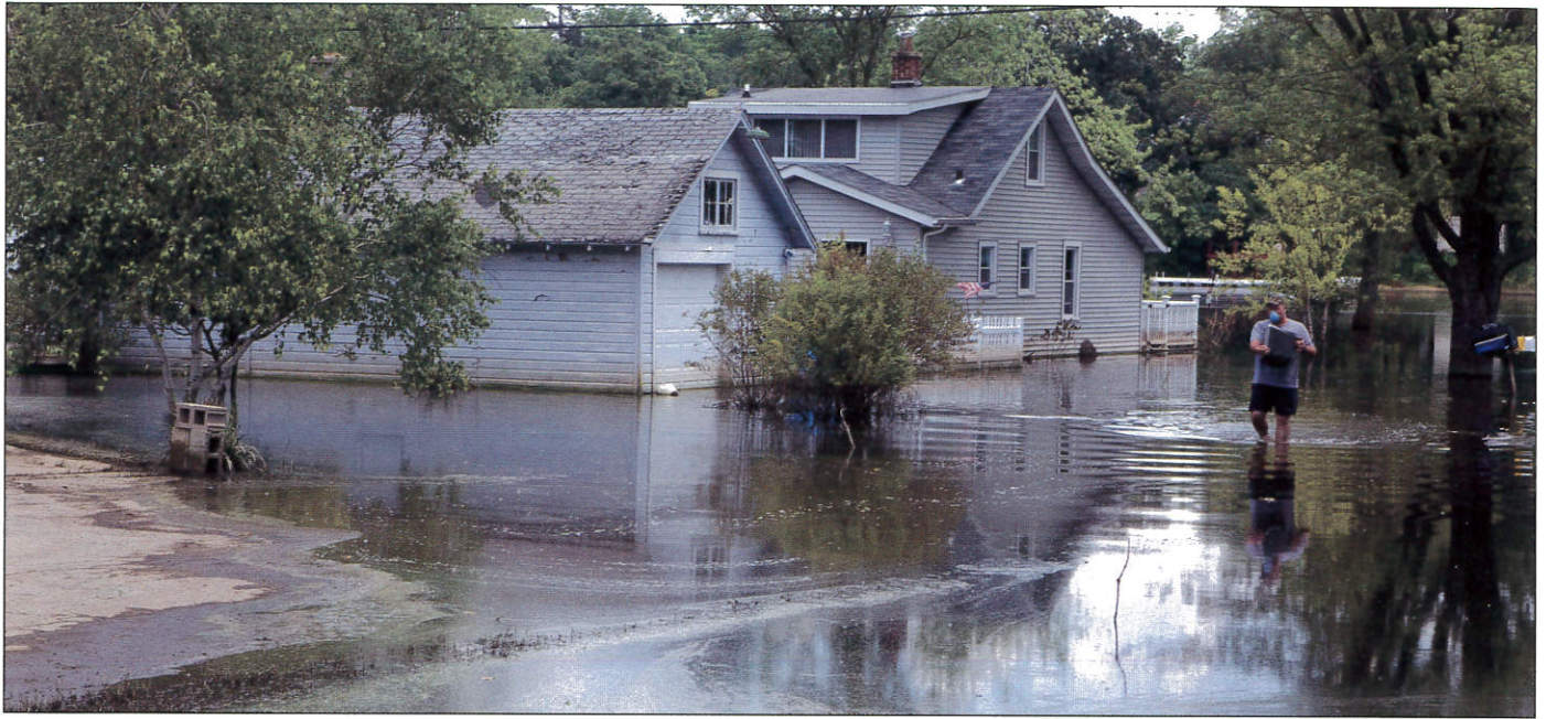
Janesville, Wisconsin, 2008