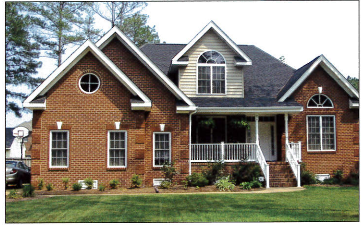
Elevated home on crawl space foundation

make conventional loans for insurable buildings in flood hazard areas of non-participating communities. However, the lender must notify applicants that the property is in a flood hazard area and that the property is not eligible for Federal disaster assistance. Some lenders may voluntarily choose not to make these loans.