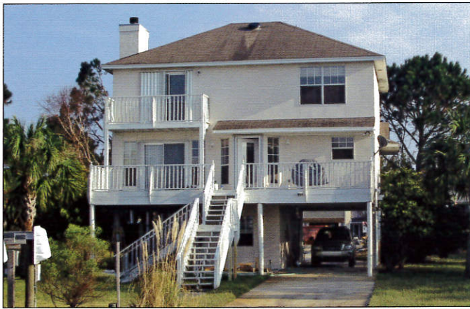
Elevated home on pile foundation