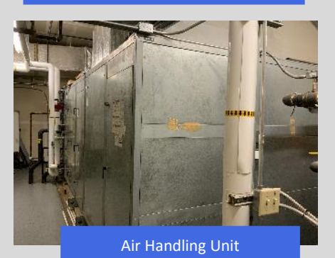
McKinstry For The Lite 81 Your Building