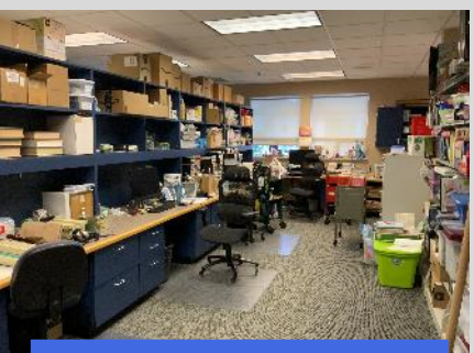
Interior Lighting (T8 fluorescent)