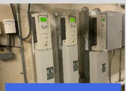
Variable Frequency Drives