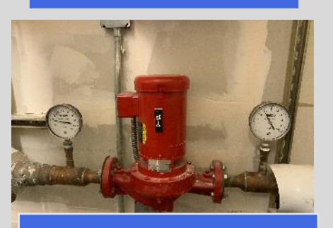
Chilled Water Pumps