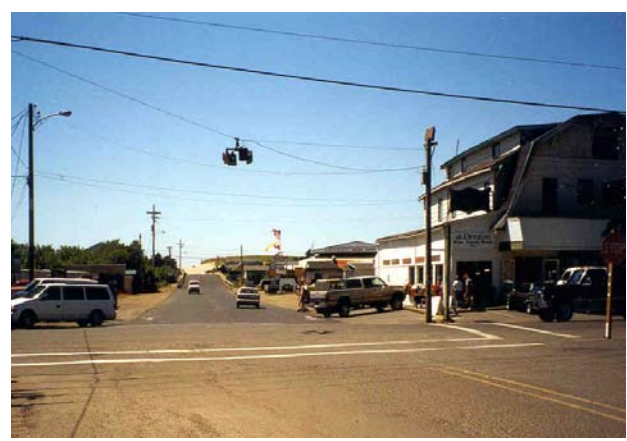
Brooten Road/Pacific Avenue Intersection