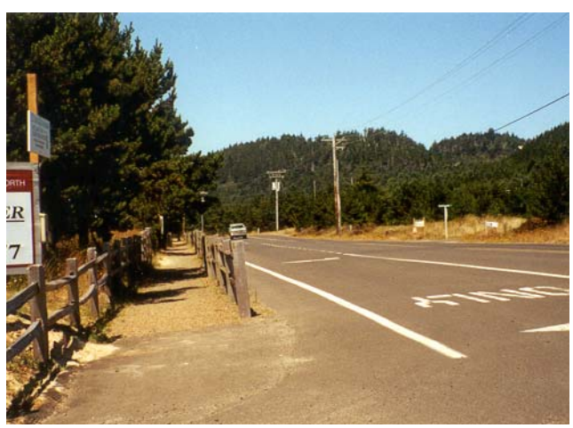
Cape Kiwanda Drive Pathway & Turn-Lane

• Shorepine Village, which has paved pedestrian trails and a boardwalk that connect the development to Cape Kiwanda Drive and the beach. The pathways connect to streets within the development and are also used by bicyclists (excluding the boardwalk to the beach). These pathways, although privately owned, are available for use by the public.