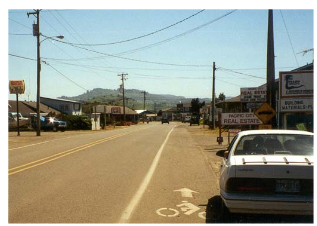
Brooten Road South of 4-Way Stop

South Brooten Rd. from Slough Bridge north to Pacific Avenue - approx. 32' pavement with two 12-foot travel lanes and 4' bicycle lanes. Possible access management issue - continuous vehicle access (no defined driveways, ill-defined parking, no defined pedestrian access).