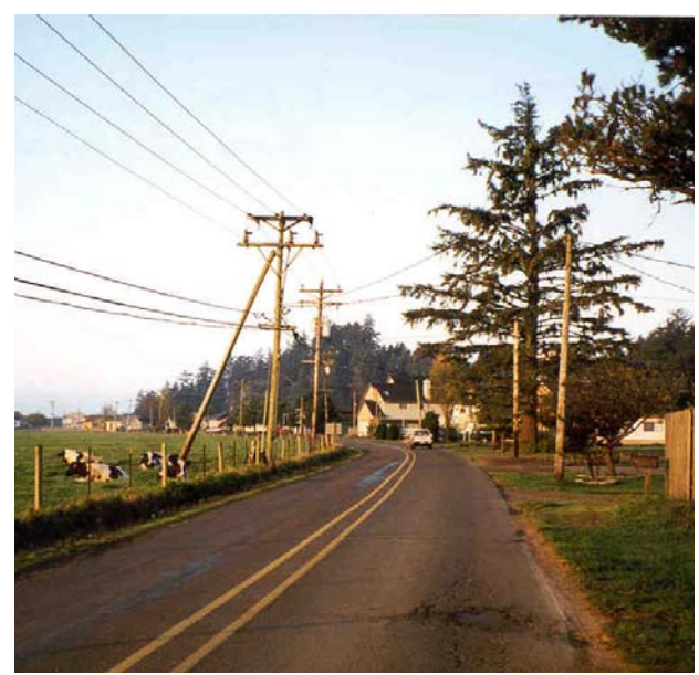
North Brooten Road - Looking South

To compile information into a transportation plan. Included in this effort is the development of multimodal plans to be implemented in conjunction with the more traditional capacity improvements. With the transportation plan, a list of transportation projects was developed with identification of possible funding mechanisms. Policy statements for Tillamook County Comprehensive Plan amendments are also included.