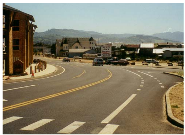
Cape Kiwanda Drive at the Cape

Cape Kiwanda Drive is the primary access to Pacific City from the north. Cape Kiwanda Drive generally has a 24-foot pavement width with two 12-foot travel lanes. Turn-lanes are provided at the Cape, Shorepine Village, and Kiwanda Shores. Bicycle lanes are limited to the Cape area. Pedestrian facilities are limited to a pathway along the Shorepine Village frontage and the northern frontage of Kiwanda Shores; and sidewalks at the Cape. The right-of-way (30') and pavement (22') narrows near the Pacific Avenue intersection. Cape Kiwanda Drive turns into McPhillips Drive at the north end of the community.