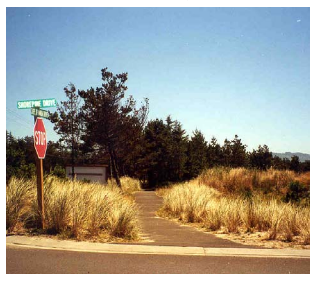
Bicycle/Pedestrian Path at Shorepine Village