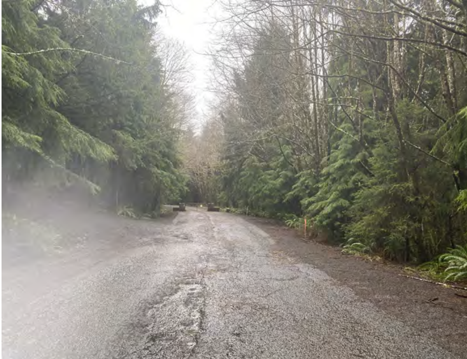
Part of Cape Meares Loop outside the gate going South from Bayocean Drive, that is within project limits.