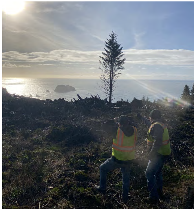
The crew "exploring" (surveying) the area.

https://highways.dot.gov/federal-lands/projects/or/tillamook-b780-1