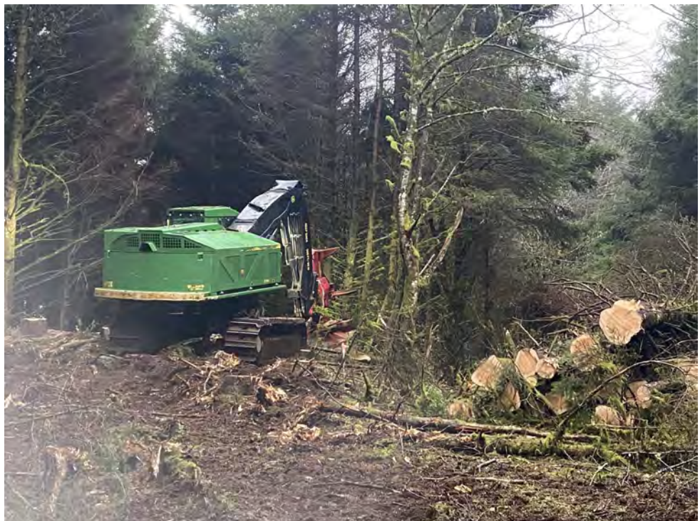
Tree falling operation for the managed timber land