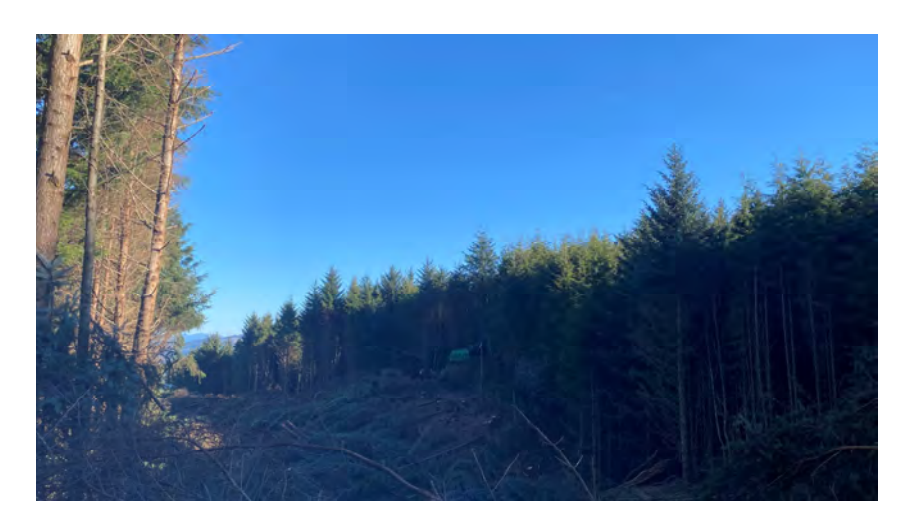
Corridor cut for the new road on the north side of the project

https://highways.dot.gov/federal-lands/projects/or/tillamook-b780-1