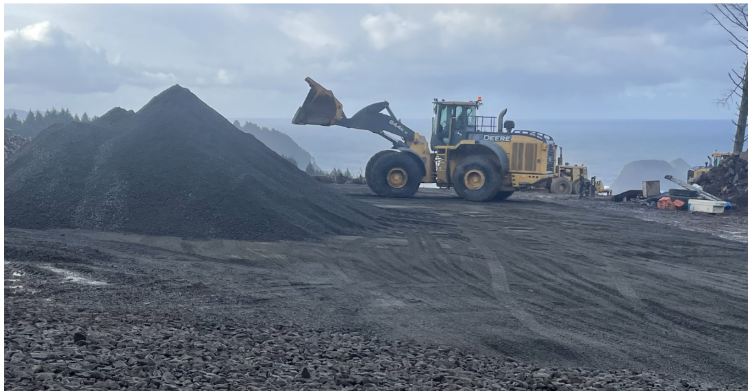
View of stockpile overlooking South project entrance.

https://highways.dot.gov/federal-lands/projects/or/tillamook-b780-1