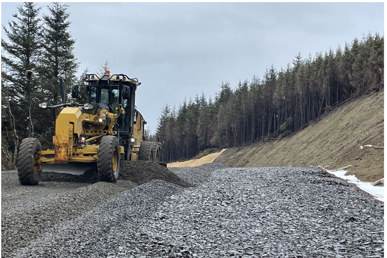
Grading newly placed aggregate