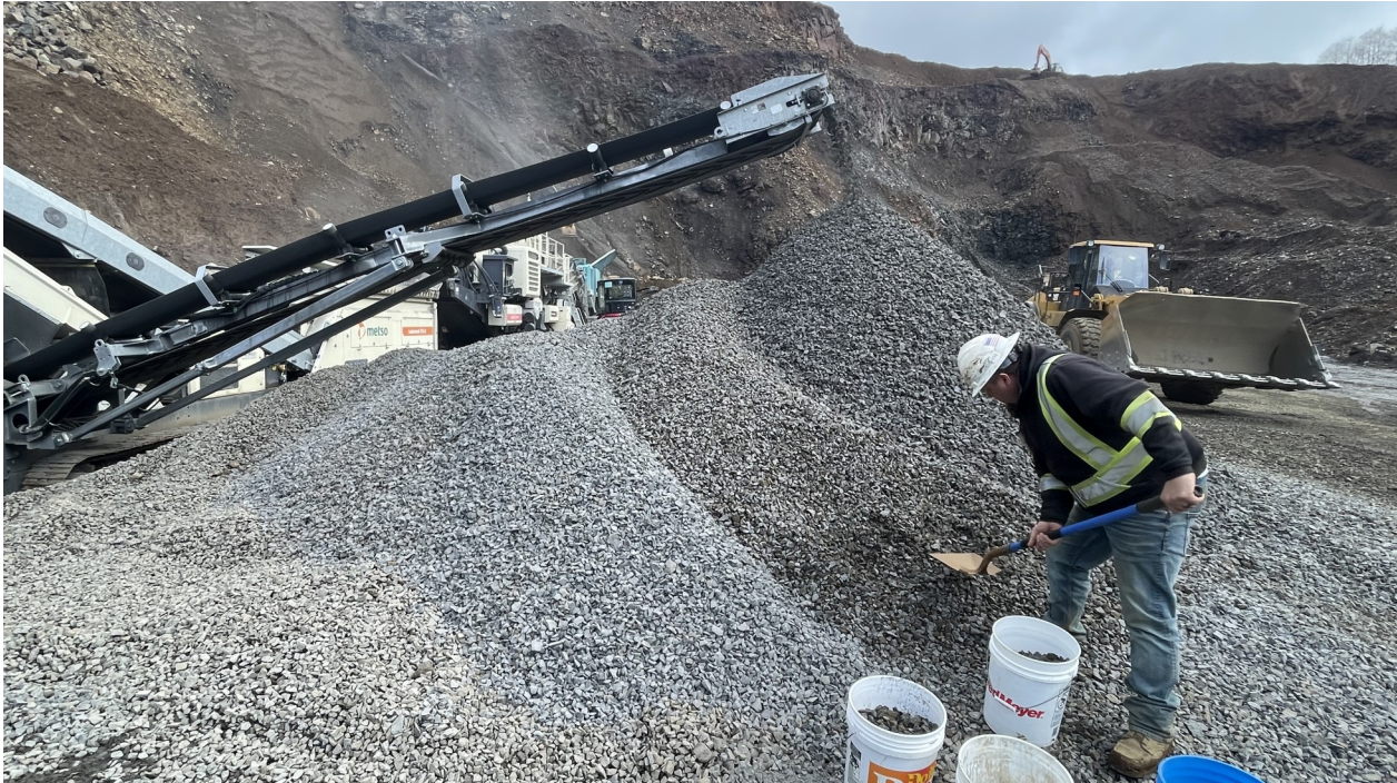
Aggregate sampling from quarry