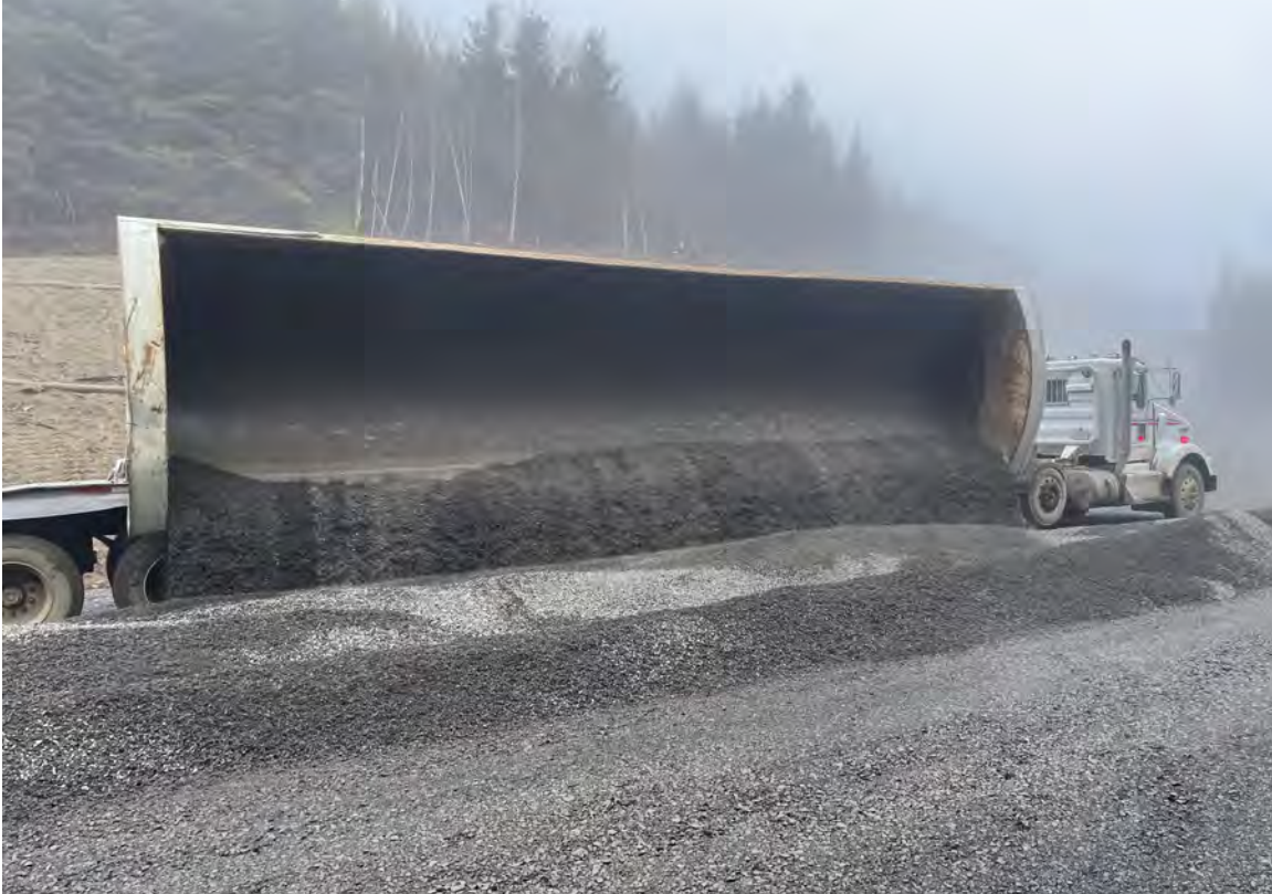
View of roadway aggregate placement prior to grading and compaction.