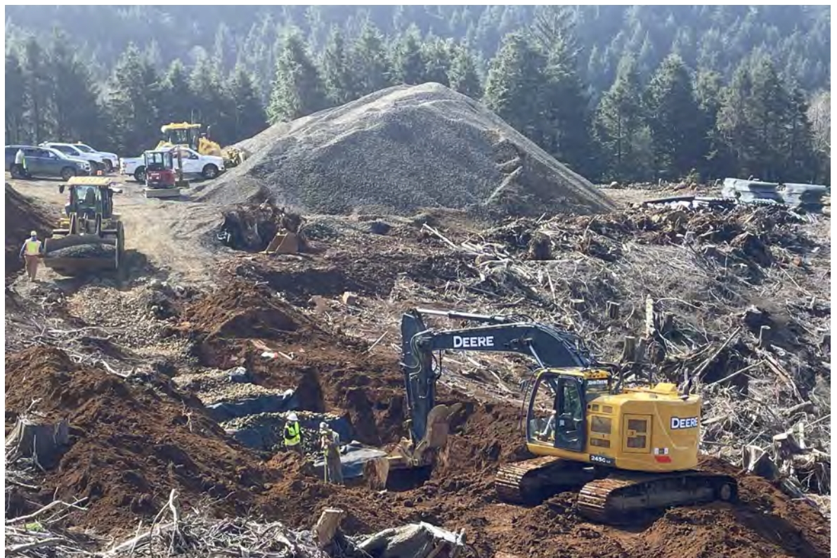
Overview of MSE Wall foundation excavation.