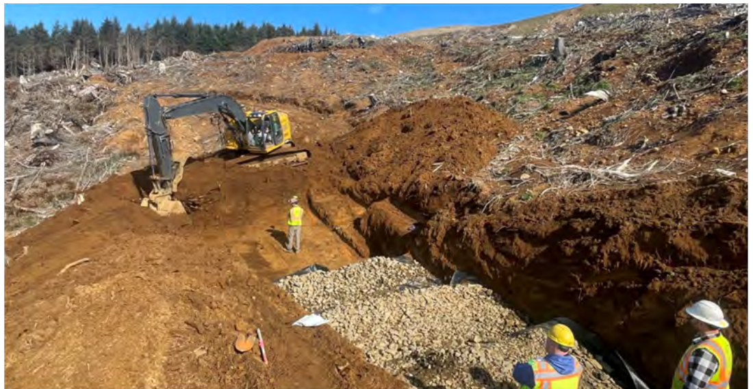
View of MSE Wall foundation excavation on 03/22/23.

https://highways.dot.gov/federal-lands/projects/or/tillamook-b780-1