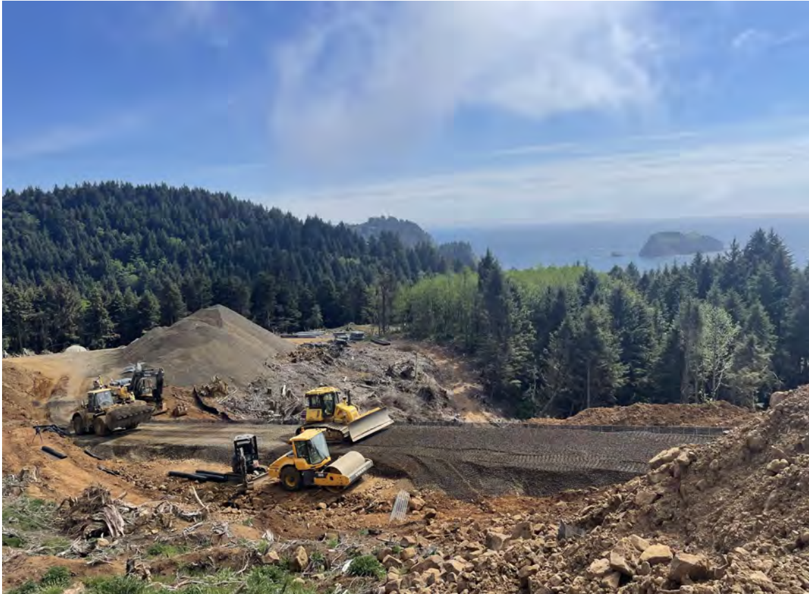
Panoramic view of MSE Wall No. 3 construction.