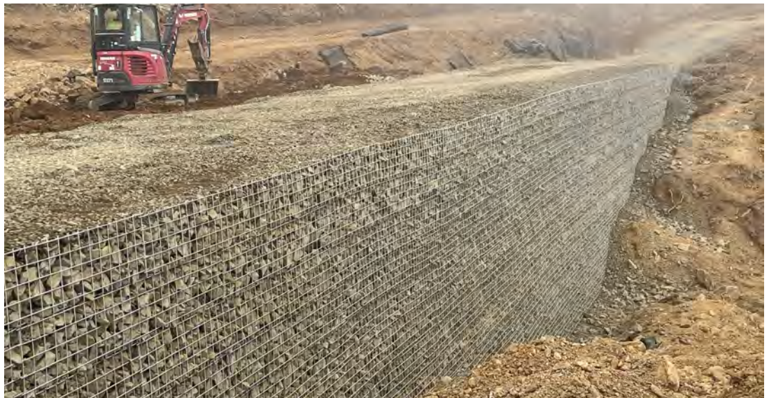
View of MSE Wall No. 3 after 13 courses.