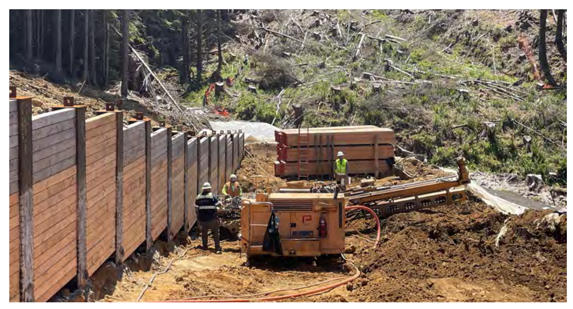
View of horizontal drilling at soldier pile wall during ground anchor installation.

Current road closure points will remain in effect on Bayocean Road near the Cape Meares Lighthouse, and approximately 0.5 miles south of the Lighthouse. Construction will have minimal impact on public traffic as it is closed to through traffic. Please be advised that project limits are now designated by barricades on Cape Meares Loop coming south from Bayocean Road. See map on the following page for areas not accessible to the public.