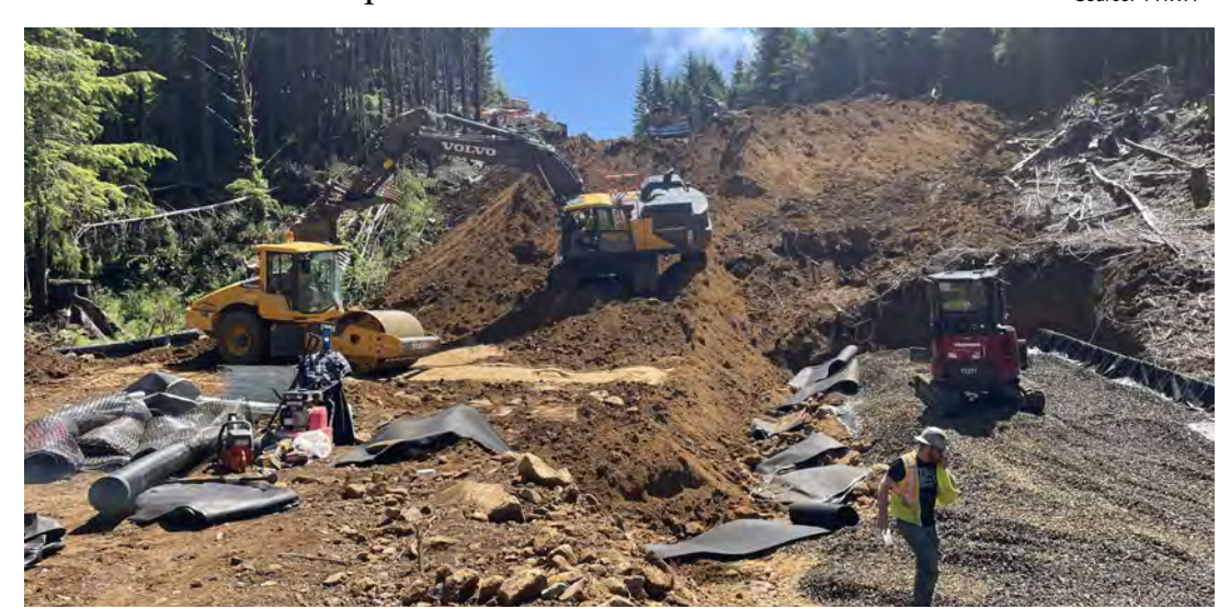
View of roadway fill operations behind MSE Wall.

Current road closure points will remain in effect on Bayocean Road near the Cape Meares Lighthouse, and approximately 0.5 miles south of the Lighthouse. Construction will have minimal impact on public traffic as it is closed to through traffic. Please be advised that project limits are now designated by barricades on Cape Meares Loop coming south from Bayocean Road. See map on the following page. for areas not accessible to the public.