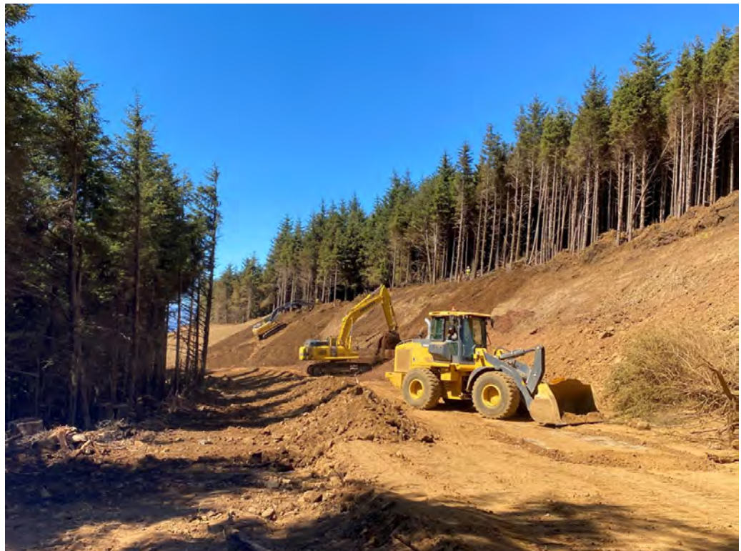
Equipment finishing slopes