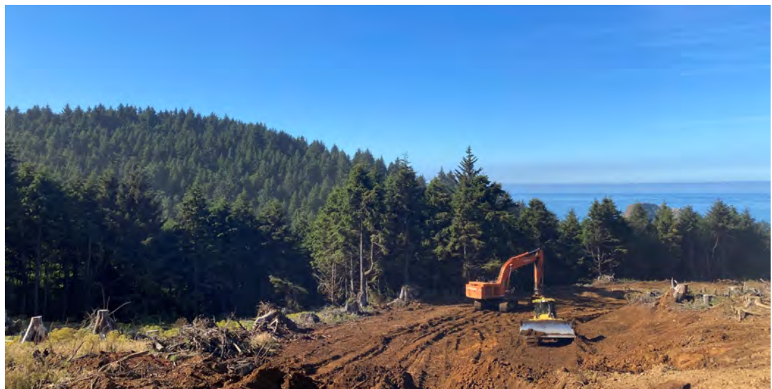
Excavation at st387.

https://highways.dot.gov/federal-lands/projects/or/tillamook-b780-1