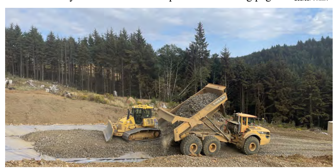
View of roadway aggregate base course placement.

Current road closure points will remain in effect on Bayocean Road near the Cape Meares Lighthouse, and approximately 0.5 miles south of the Lighthouse. Construction will have minimal impact on public traffic as it is closed to through traffic. Please be advised that project limits are now designated by barricades on Cape Meares Loop coming south from Bayocean Road. See map on the following page.