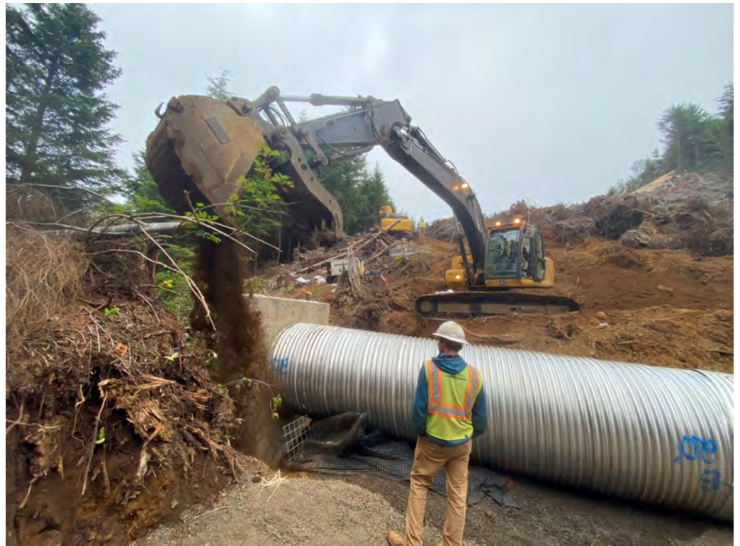
Backfilling the headwalls