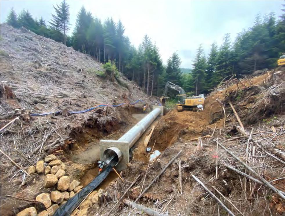
Concrete headwalls after form removal