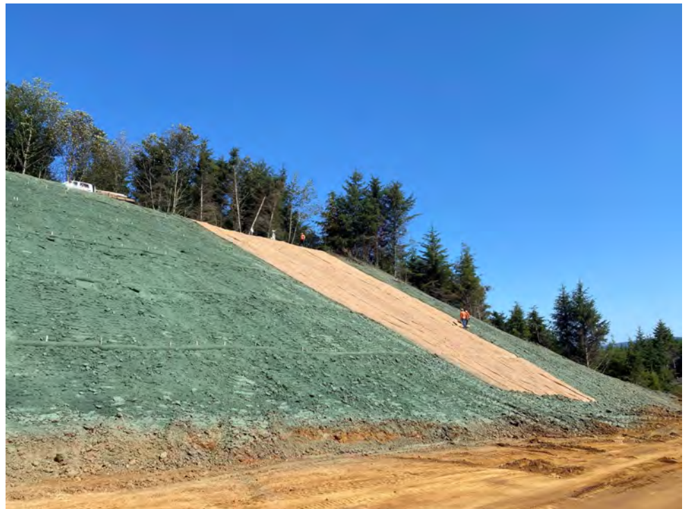
Placing rolled erosion control product on slopes