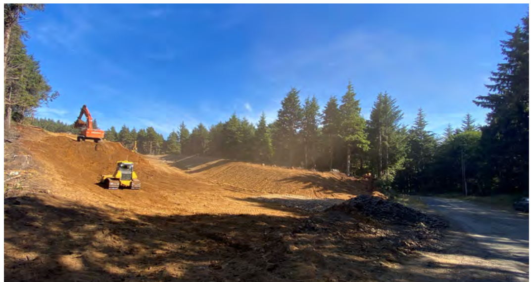
Excavation at st389.