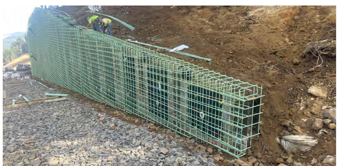
View of soldier pile wall reinforcing bar placement nearing completion. Project Website:

https://highways.dot.gov/federal-lands/projects/or/tillamook-b780-1