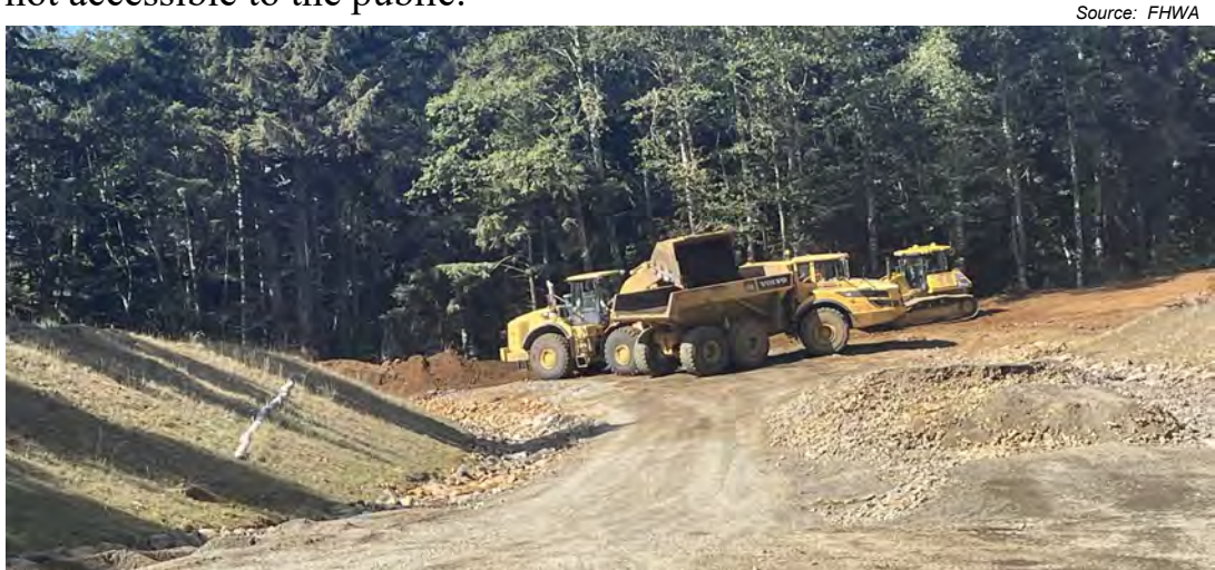
View of existing base aggregate removal near south entry of project. Project Website:

Current road closure points will remain in effect on Bayocean Road near the Cape Meares Lighthouse, and approximately 0.5 miles south of the Lighthouse. Construction will have minimal impact on public traffic as it is closed to through traffic. Please be advised that project limits are now designated by barricades on Cape Meares Loop. coming south from Bayocean Road. See map on the following page for areas not accessible to the public.