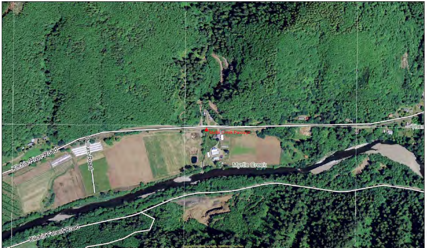
Myrtle Creek Fish Passage: Aerial

Note: Section 106 compliance assistance is being provided solely for the activities as defined in the request for cultural resource compliance submitted to the CRT for the project. Changes to the planned activities and any future projects in this area may be subject to additional Section 106 compliance efforts.